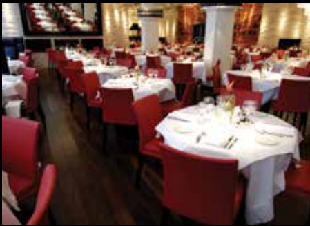
San Carlo Liverpool 41 Castle Street, L2 9SH 0151 227 5700