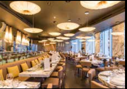
Fumo Manchester 1 St Peters Square, Oxford Road, Manchester M1 5AN 0161 236 7344