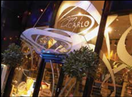
San Carlo Birmingham Temple Street, B2 5BN 0121 633 0251