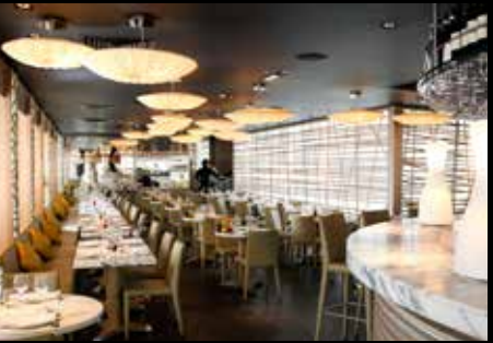
Fumo Birmingham 1 Waterloo Street, Birmingham, B2 5PG 0121 643 8979