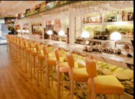
Cicchetti Manchester House of Fraser, ground floor, King Street West, Manchester 0116 839 22 33