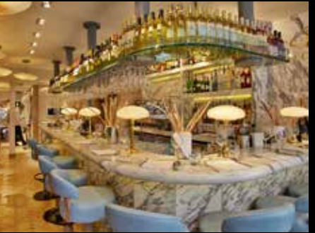
Cicchetti Covent Garden 30 Wellington St, London WC2E 7BD