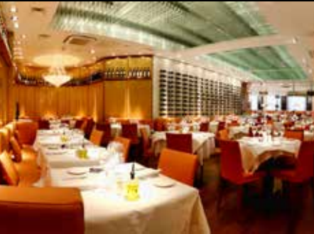
San Carlo Manchester 40-42 King Street West, M3 2WY 0161 834 6226

We are proud to be able to provide the true essence of authentic Italian food, with an Italian director, management and chefs. Using the finest fresh ingredients, many of which are specially imported from Italy, San Carlo is able to create an explosion of culinary tastes. All San Carlo restaurants create food of the highest quality, but each restaurant displays its own unique style in food due to the individuality of our creative chefs and management style.