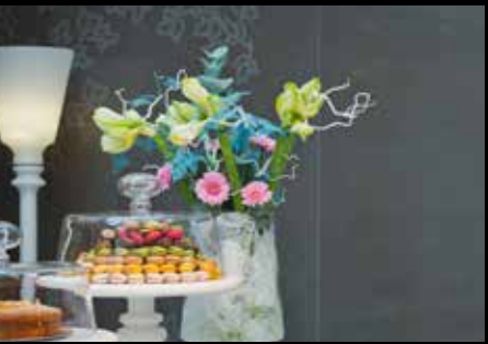
Gran Cafe Selfridges, Exchange Square, Lower ground floor, Manchester, M3 1BD 0161 838 0540