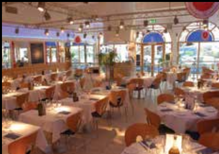
San Carlo Leicester 38-40 Granby Street, LE1 1DE 0116 251 9332