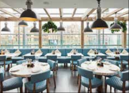
Bottega Selfridges, Exchange Square, Second floor, Manchester, M3 1BD 0161 838 0571