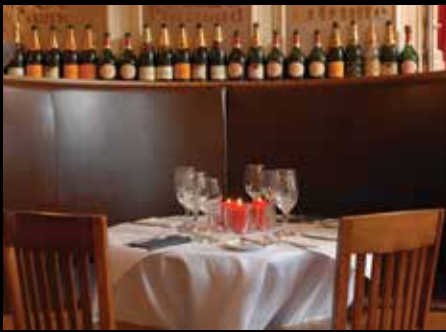
Le Petit Rouge 40 Granby Street, Leicester LE1 1DE 0116 251 8484