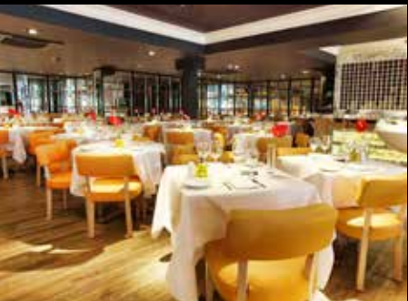
Flying Pizza 60 Street Lane, Roundhay, Leeds, LS8 2DQ 0113 266 6501