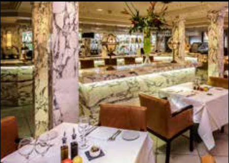
San Carlo Fiorentina Manchester Airport, Marriott Hotel, Hale Road, Hale Barns, Cheshire 0161 904 5043