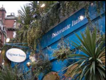
Signor Sassi London 14 Knightsbridge Green, London SW1X 7QL 020 7589 3586