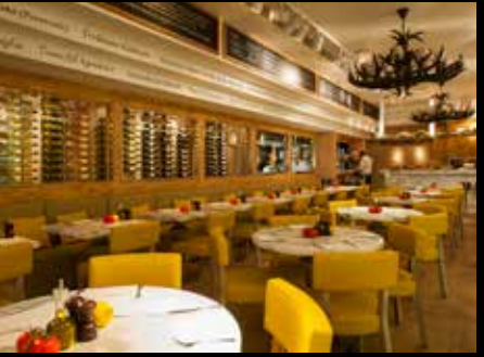
Cicchetti Piccadilly London 215 Piccadilly, London, W1J 9HL 0207 494 9435