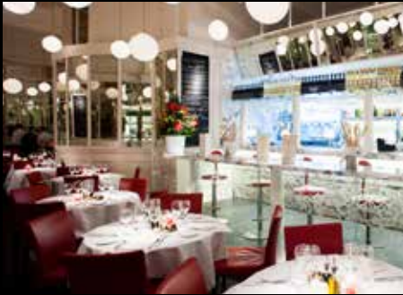
San Carlo Bristol 44 Corn Street, BS1 1HQ 0117 922 6586