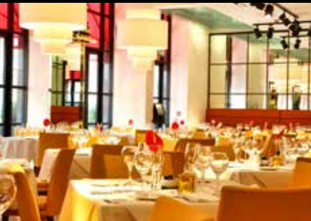
San Carlo Leeds 6 - 7 South Parade, Leeds. LS1 5QX 0113 246 1500